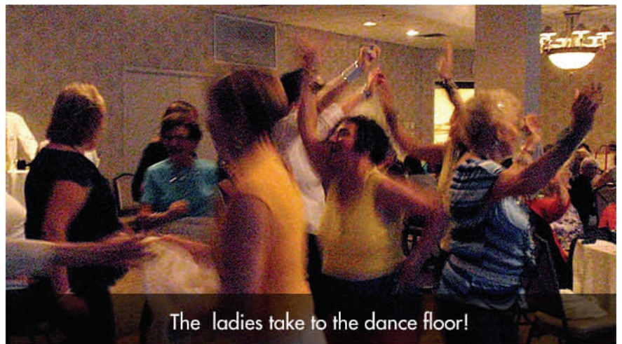
The ladies take to the dance floor!