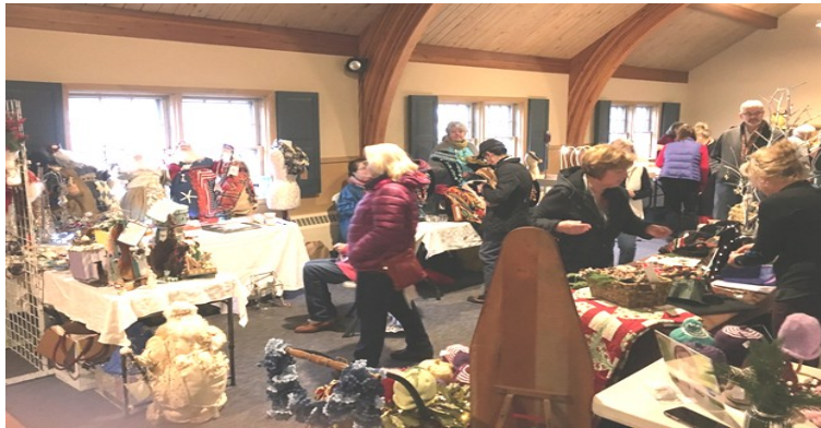
There were many happy shoppers at our beautiful Holiday Fair!